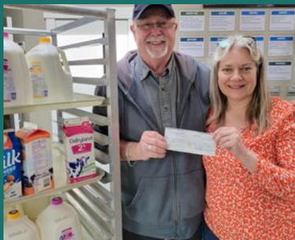
Ev delivers a cheque from Sardis Kiwanis

40 jugs of milk each week x 32 weeks of Doorway ~ that's a lot of milk! Thank You Sardis Kiwanis! With the increase in the price of milk, we have a bit of a shortfall ~ will you help fill the gap?